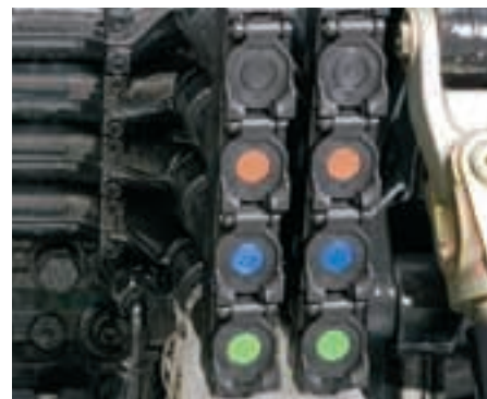
Hydraulic control levers and remote coupler dust covers are color-coded to assist with easy implement hook up and control.