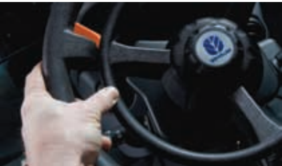
To engage FastSteer, simply press on the inner ring of the steering wheel. The FastSteer system automatically disengages when travel speed exceeds 10 km/h.