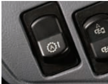
Just press the "Auto" button, and the Power Command™ transmission automatically shifts up or down within a span of gears based on engine RPM and applied flywheel torque.