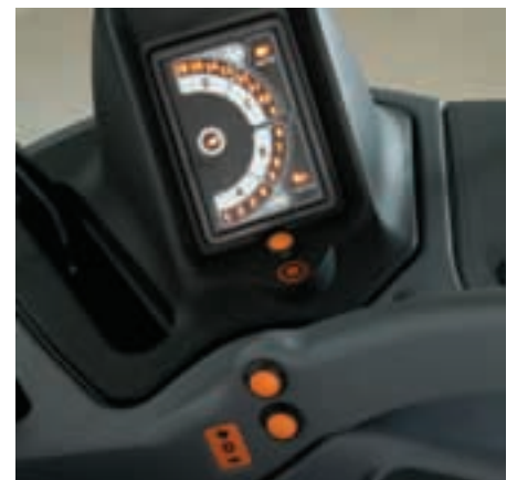
AutoShift™ transmissions provide automatic shifting in the field or one the road. You program the shift point and shuttle preferences.

even more time-saving features. Push the "Auto" button while operating in the field, and the AutoShift transmission does the shifting for you within the four gears of Ranges A (Gears 1 to 4), B (gears 5 to 8) or C (Gears 9 to 12). When roading, press the AutoShift button once to shift as needed within Ranges C or D; press the AutoShift button twice to move freely from gear 9 through gear 16 and back down as needed without stopping to shift