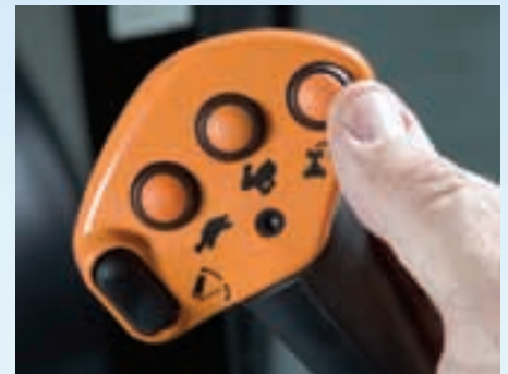
Switches on the right-hand console are used to alert the system that you are ready to record (A) or play back (B) a sequence of actions. Then, press the “step” button to actually activate the recording or playback. The step button is located on the multi-controller (C) on Elite six-cylinder models, and on the seat-mounted electronic draft control mouse on Elite four-cylinder models.