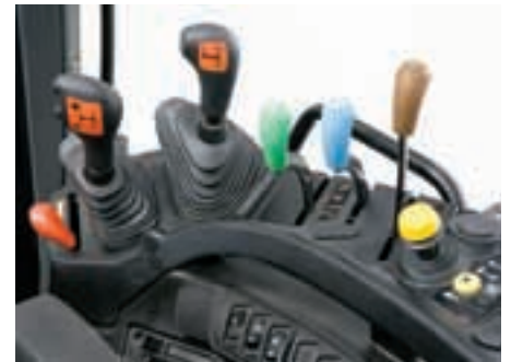
The 24x24 Dual Command transmission doubles your gears from 12 to 24. Underdrive button on the side of the shift lever and on the console (B) allows you to powershift on-the-go without clutching.

and reduces tractor speed by approximately 22%. Dual Command buttons are located right on the gearshift lever to allow you to powershift on-the-go without clutching. Use the lower button (tortoise) to engage the underdrive. Push the upper button (hare) to disengage Dual Command and return to direct drive. This transmission provides the benefit of up to 11 speeds in the two- to eight-mph working range for maximum versatility. Transport speed is 30 km/h for 2WD models and 40 km/h for FWD models.