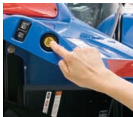
Quick-raise hitch switches are provided on both rear fenders on tractors equipped with electronic draft control. An exterior PTO switch is also optional on the rear fender of all cab models (except 12x12 transmission). Press the button for less than five second for a pulsing action that makes it easier to hook up the PTO shaft. Hold the button for longer than five seconds to fully engage the PTO.