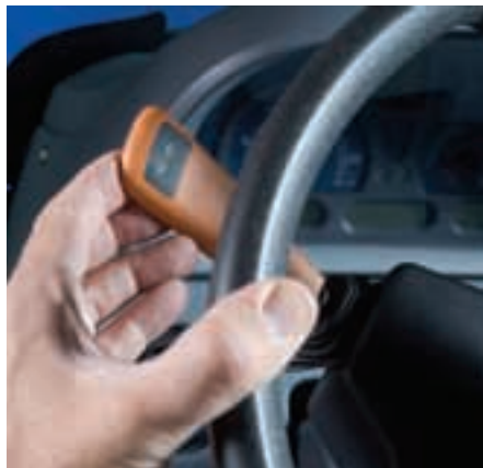
The clutch-free power shuttle is electro-hydraulically engaged and located to the left of the steering column for easy fingertip control.