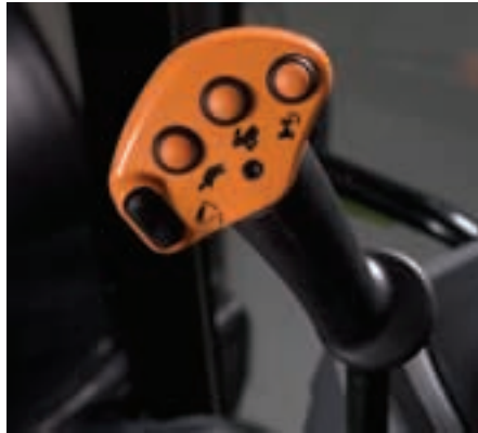
The convenient seat-mounted multi function controller gives you complete transmission control on Power Command equipped models.